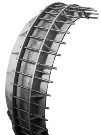
JCM 143 - 14" - 36"