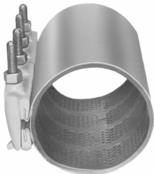
JCM 101 Universal Clamp Coupling Image reflects 12" width

JCM 100 Series Universal Clamp Couplings are ANSI/NSF Standard 61 Certified.